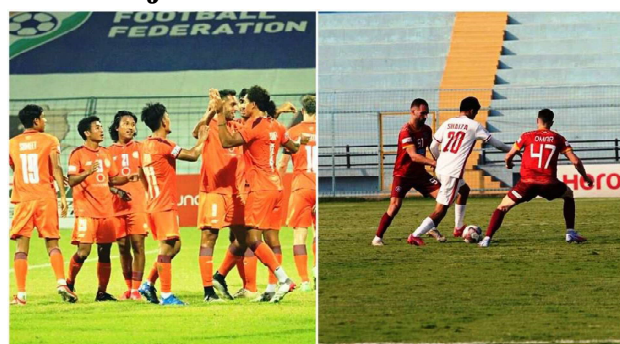
Punjab FC (left) jumped to top-four with their second win from three matches, while debutants Rajasthan United FC (right) secured their maiden victory in the I-League.

League champions, RUFC began on a positive note and held the possession.